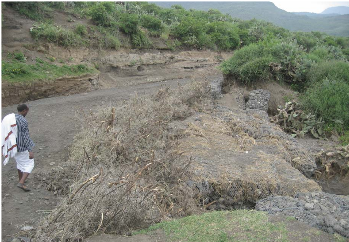
Plate 5.3: Damaged primary canal at Boboteya spate irrigation system

In the study areas the traditional spate irrigation infrastructure mainly comprises the diversion weir and the irrigation channels. According to the information collected from the sample farmers and the water committees the most sever problem with regard to the traditional spate irrigation in Boboteya is the damage caused to the primary canal. The side of the primary canal adjacent to the main river usually breaks down by heavy floods. As a result the diverted flood spills back to the river through the broken side of the main canal. The area supplied with spate water is therefore reduced due to the loss of spate water.