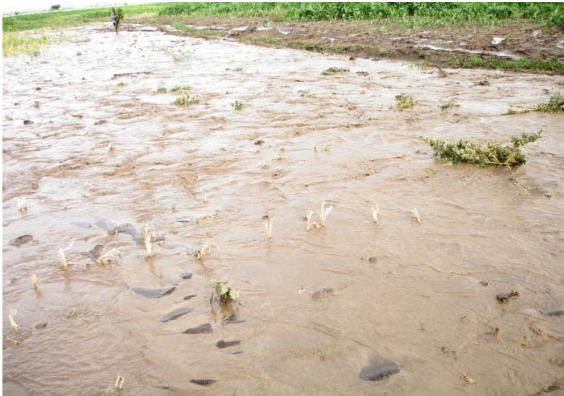
Plate 5.2: Inundated field in Fokisa spate irrigation system

The spate water distribution arrangements in the study areas try to compromise between fair distribution among the farmers and prevention of wastage of spate water. According to the discussion held with the water committee members the distribution arrangement is made to be as fair as possible by insuring the sequential distribution of spate water among the different groups in the system. In this case who should get the first, the second and the third spate is determined by lottery draw performed in public. Regardless of its position in the spate irrigation system, a group gets spate water according to its turn which is determined by the lottery draw. This method of spate water distribution helps to create sense of ownership among the Melwens in the system.