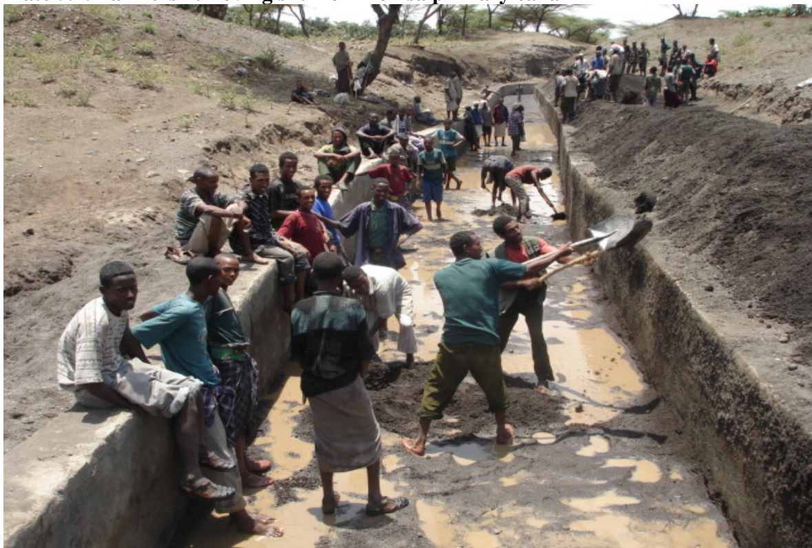
Plate 5.1: Farmers removing silt from Fokisa primary canal

Regarding the trend of O and M frequency after modernization in Fokisa SIS 62.5% of the respondents said it has increased while 25% said there is no change when compared to the traditional SIS. According to the farmers before its modernization the major task of O and M on the traditional SIS was on the main diversion weir and primary canal. After the modernization most of the O and M activities are silt removing that accumulate over the modern diversion weir and the main canal after heavy flood.