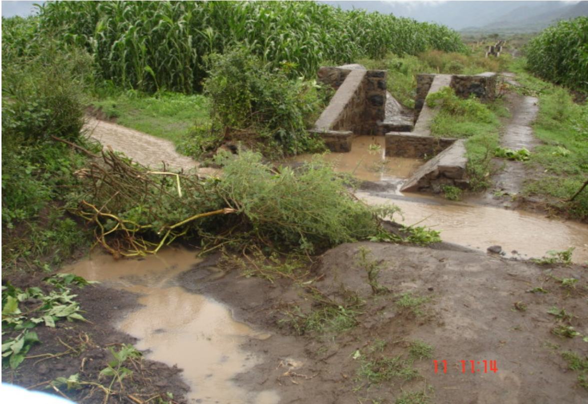
Plate 5.6: Traditional versus modern spate irrigation canals in Hara

Taking lesson from the failure at Hara and similar unsuccessful modernization intervention works project planners and designers in Fokisa SIS tried to involve farmers in the planning and design activities. After the discussion held with all the beneficiary community to assess their support to the modernization of the traditional scheme they were allowed to get involved and forward their view on what components should the modernization work incorporate. In this case community members, the tabia administration and water committee members were involved at different levels and shared their view and experience and expectation from the modernization of the scheme. For instance the site where the diversion weir was constructed is exactly where the traditional diversion was situated. One major demand of the farmers during the planning process was they wanted the new diversion structure to divert as much water as possible by contracting large takeoff and