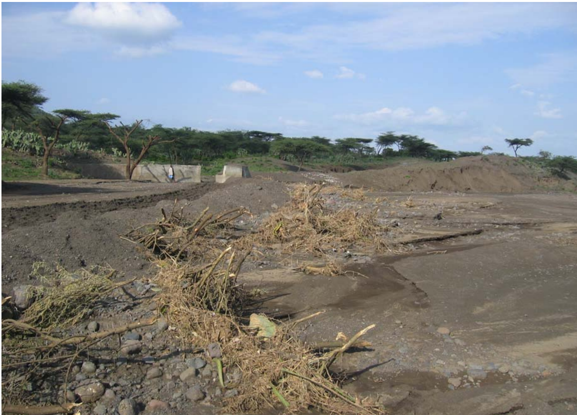
Plate 5.5: Traditional approach canal over modern diversion weir at Fokisa